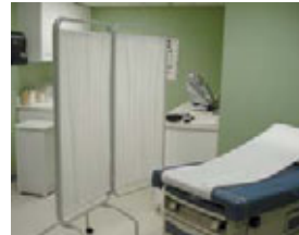
View of clinic examination room.

Have you been to the clinic yet? Many BPC employees have, so many that they've added three additional clinic hours. When Kathy Bowen tried to schedule an appointment she had to wait two weeks, but now that a third day has been added to the clinic schedule this should no longer be a problem. The clinic will now be open three hours per day, three days a week.